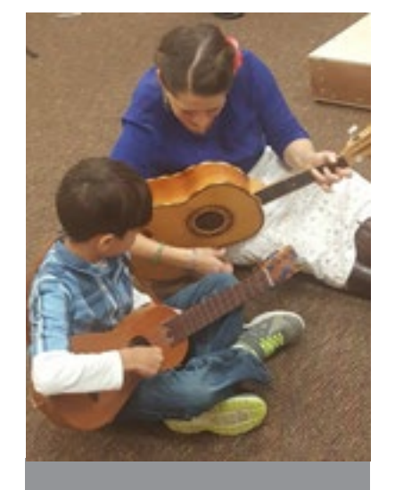
Cascada de Flores Music Workshop.