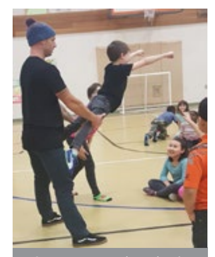
Superman practicing during the 360 ALLSTARS Circus Workshop!