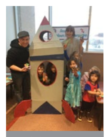
The cast of Celeste with children at a library vorkshop where they made cute little rockets.