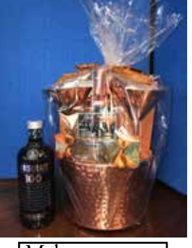
Make your own Martini Basket