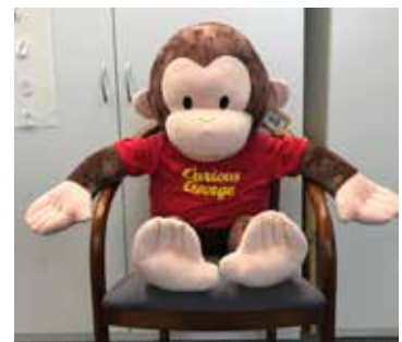
Stuffed Curious "George-zilla"