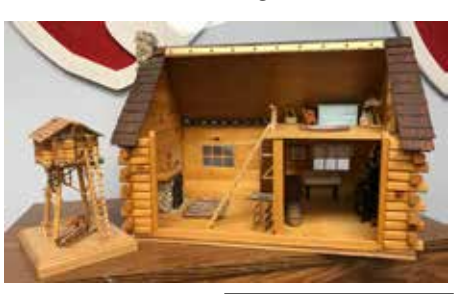
Antique Alaskan Dollhouse