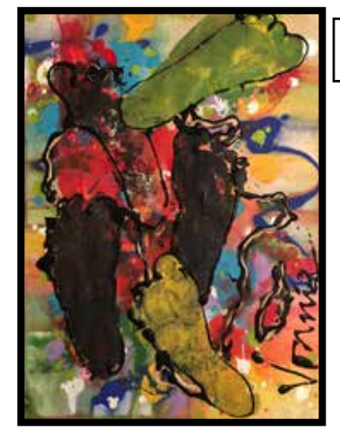
Art by Vonnie "Barefootin"

Here is just a small sample of items to be showcased at AJT's Benefit Silent & Live Auctions. Get your bidding arm warmed up – there's more to be had.