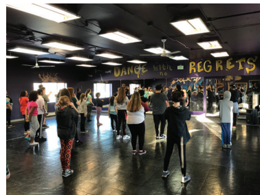
TO THE UNDERGROUND WITH STEP AFRIKA! 3-21-18