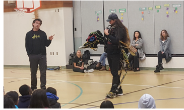
TAKING ELECTRIC CHRISTMAS TO SCHOOLS 12-18-17