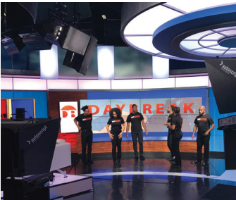
STEPPIN' ON KTVA 3-19-18