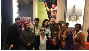
TRICK OR TREATING AFTER JOURNEY TO OZ. 10-31-17