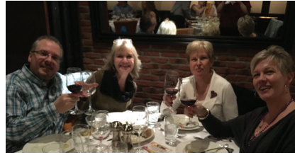
A TOAST TO AJT WINE TASTING FUNDRAISER 1-21-18