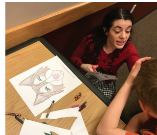
PUSHCART PLAYERS CRAFT TIME IN EAGLE RIVER 4-18-18