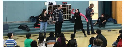
Leading a workshop for students at Ptarmigan Elementary’s after school program.