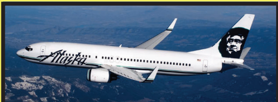
Mexico Flight and Lodging for Two!

This years live and silent auctions will feature wonderful items and packages including: