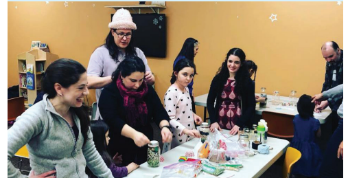
Busy making soup kits with kids and parents at the Muldoon Library.