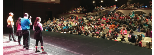
On the Discovery Theatre stage answering questions after the show.

Over the years, the Pushcart Players have proven themselves time and time again to be among the very best companies to come perform with Alaska Junior Theater (and just between us, be on the lookout for them to come back to Alaska in the very new future for a fun and furry adventure).