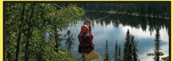
Denali Zipline Adventure for Two!