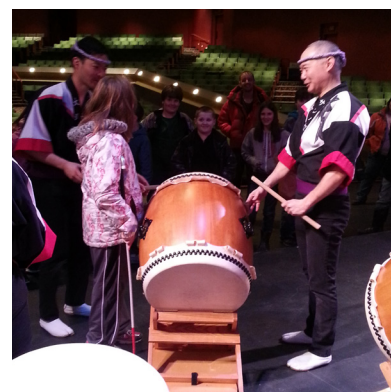
A blind student get a personal introduction to the drums used by San Jose Taiko.