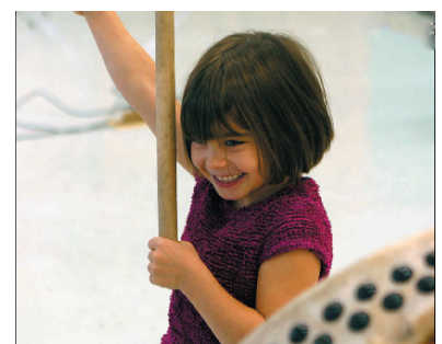
San Jose Taiko drumming workshop.