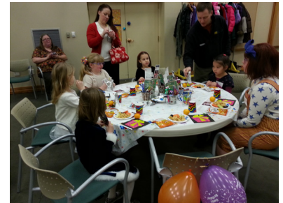
The kids enjoyed attending Junie B's birthday party before seeing the public performance.