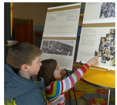
The photo exhibit for Hitler's Daughter .