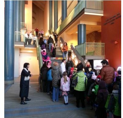
Ushering classes into the theatre for The Gruffalo with the help of our volunteers.