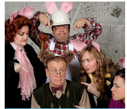
True Story of the 3 Little Pigs!