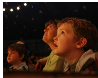
The magic of theatre.