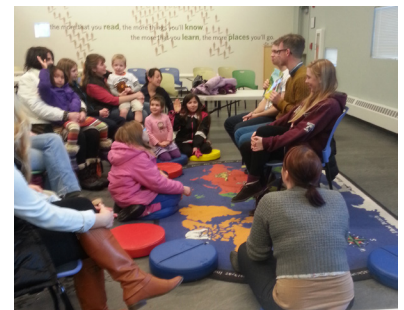
The Gruffalo library reading and craft event.