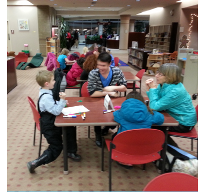
Making Wolf Masks with the cast of The True Story of the 3 Little Pigs!