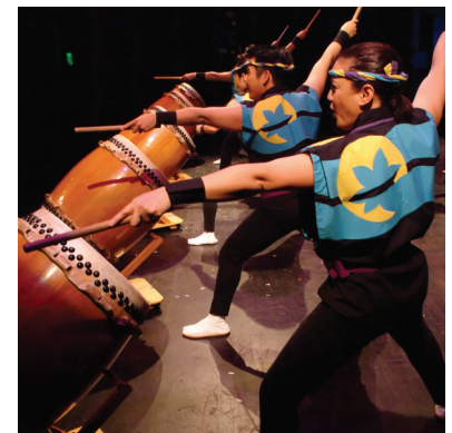
San Jose Taiko

Alaska Junior Theater's performances would not be possible without the generous support of our donors. Thank you.