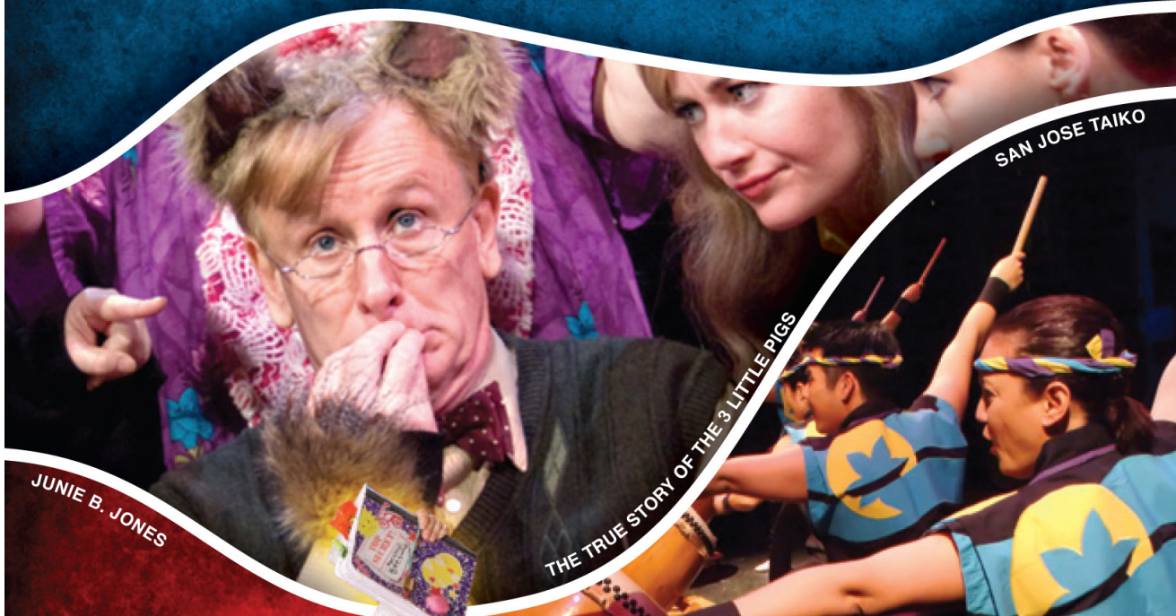
JUNIE B. JONES