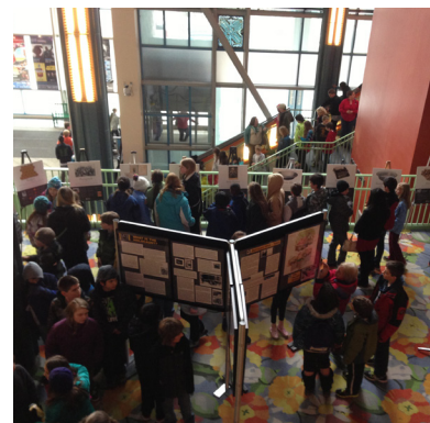
AJT imported three Holocaust Photo Exhibits for the entire week of Hitler's Daughter .