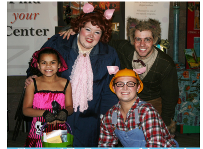
The cast of The True Story of the 3 Little Pigs! pose with Trick-or-Treaters.

This was one of the best if not the best performance I have attended. The content had direct connection to what students had learned in their social studies classes - 6th Grade, Begich Middle School.