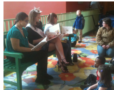
Pageant winners take time to read stories to the kids before The Gruffalo .