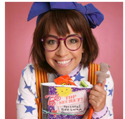
Junie B. Jones