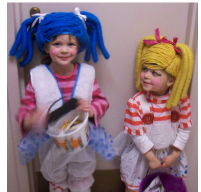
Participants in AJT's Halloween Night Trick-or-Treat Party.