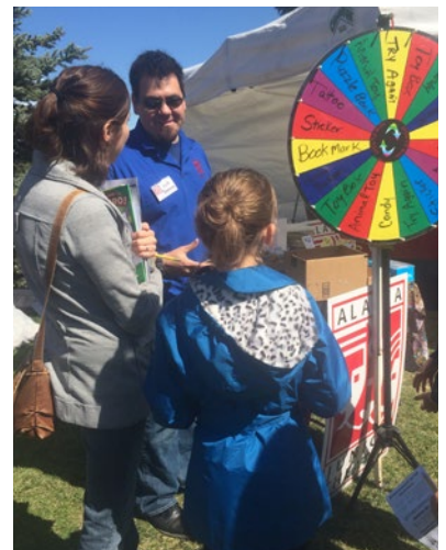
Parents learn about upcoming shows as kids spin the wheel of prizes at AJT's Reading Rendezvous booth.