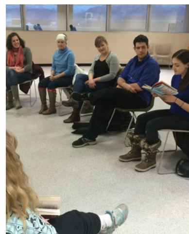
The cast of Otherwise Known as Sheila the Great reads the book aloud to an audience at a community outreach event at Loussac Library.