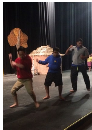
Performers of AK Pride rehearse for their opening act before the public performance of Jabali African Acrobats

I love that you bring in plays for the younger grades. I really appreciate the timing of later in the school year as those as at the beginning of the year are way more hectic. – Kindergarten, Birchwood ABC