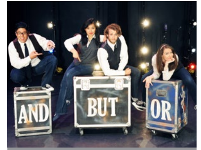
Schoolhouse Rock Live!