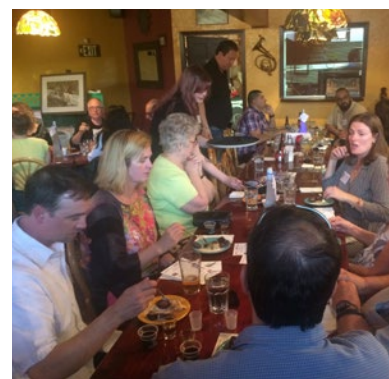
Board members, ambassadors and friends mingle at AJT's 2nd Annual Tequila & Beer Tasting Fundraiser.