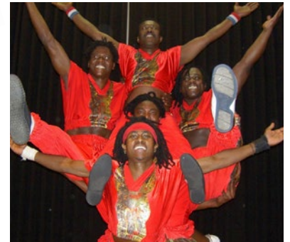
Jabali African Acrobats