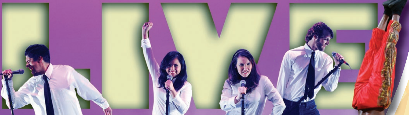
SCHOOLHOUSE ROCK LIVE!