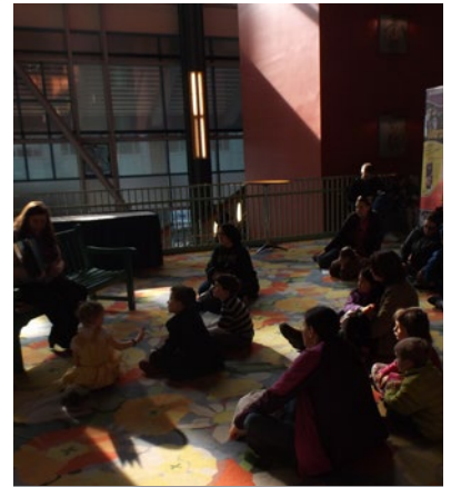
Families enjoy storytime in the lobby before the public performance of Aesop Bops!