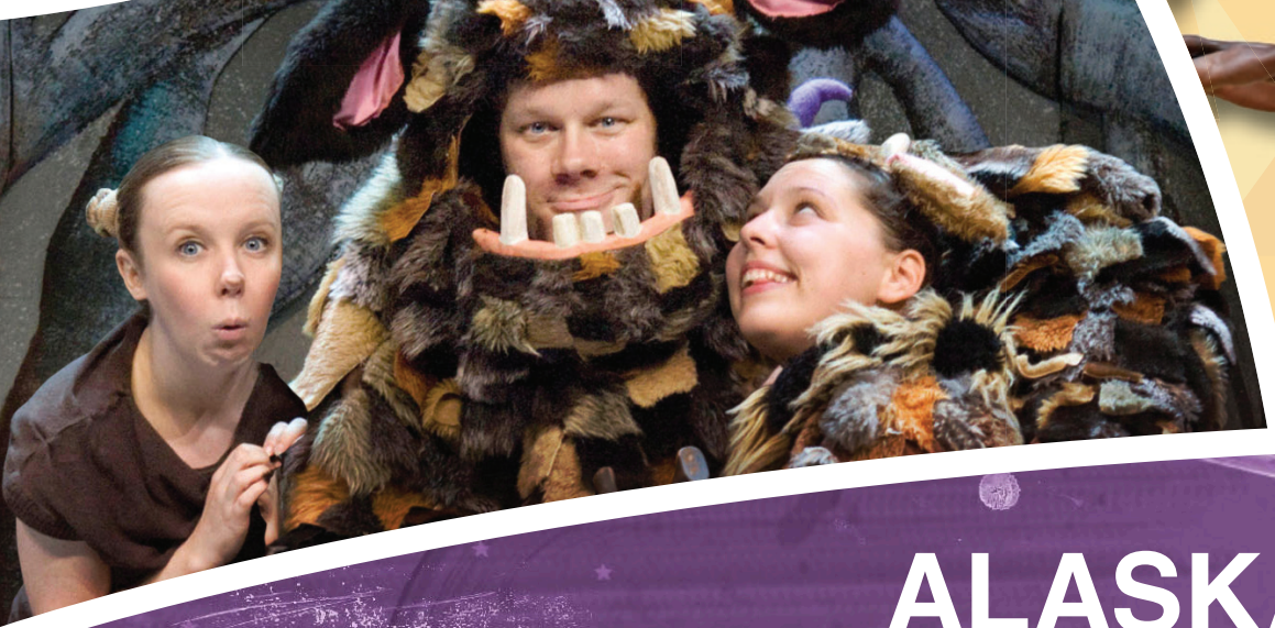
THE GRUFFALO'S CHILD