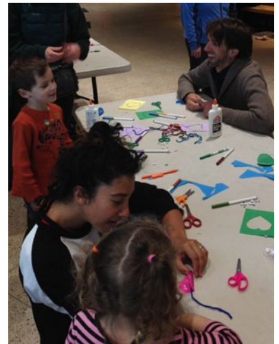
The Gruffalo's Child castmembers decorate mouse bookmarks alongside fans at a book reading & craft workshop at Loussac Library.