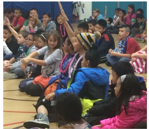
Students from Wonder Park Elementary participate in an after-school program with the cast of Schoolhouse Rock Live!

— Kindergarten Teacher, Ursa Major Elementary.