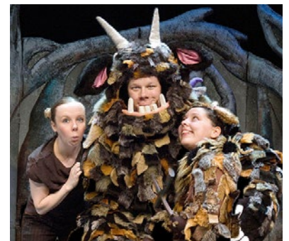
The Gruffalo's Child

Alaska Junior Theater's performances would not be possible without the generous support of our donors. Thank you!