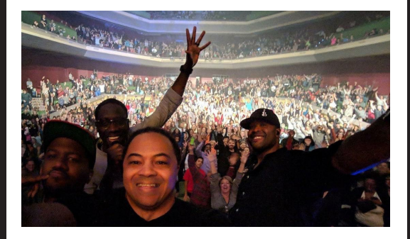
Soul Street Dance Company