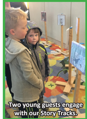
Two young guests engage with our Story Tracks.

For our 2:00 PM Matinéés, arrive an hour early to enjoy complimentary storytelling, free books and delightful story tracks in the lobby of the Discovery Theatre. Then after the show, indulge in a milk and cookie reception with the cast of the performance and participate in our cake walk, where kids can win fabulous prizes! Check out our amazing 2:00 PM performances below.