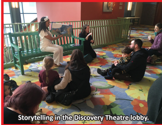
Storytelling in the Discovery Theatre lobby.