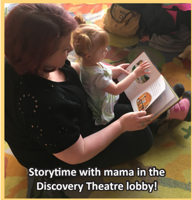
Storytime with mama in the Discovery Theatre lobby!

Join Alaska Junior Theater for Saturday Matinée Public Performances for fun activities before and after the show!