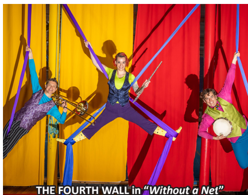
THE FOURTH WALL in "Without a Net"

Created exclusively for Alaska Junior Theater. Sound waves fly through the air like a circus artist dazzling our senses. How does it work? What's the science behind our wonder? Using a combination of music, dance, aerial acrobatics, circus skills, and scientific tools, The Fourth Wall takes students on an interactive journey through the wonders of sound in an innovative performance that taps into STEAM (Science, Technology, Engineering, Arts, Math) curriculum.