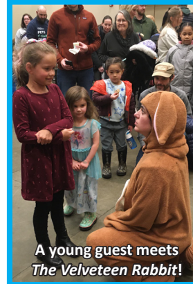
A young guest meets The Velveteen Rabbit !